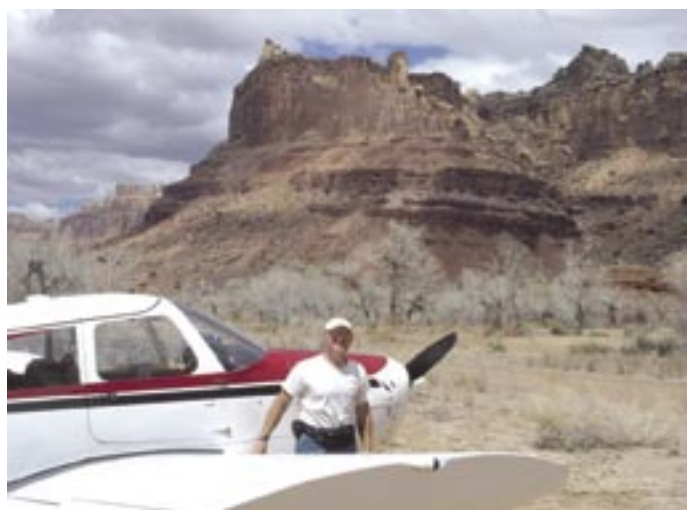
Taking time to enjoy the view at Mexican Mountain, Utah.