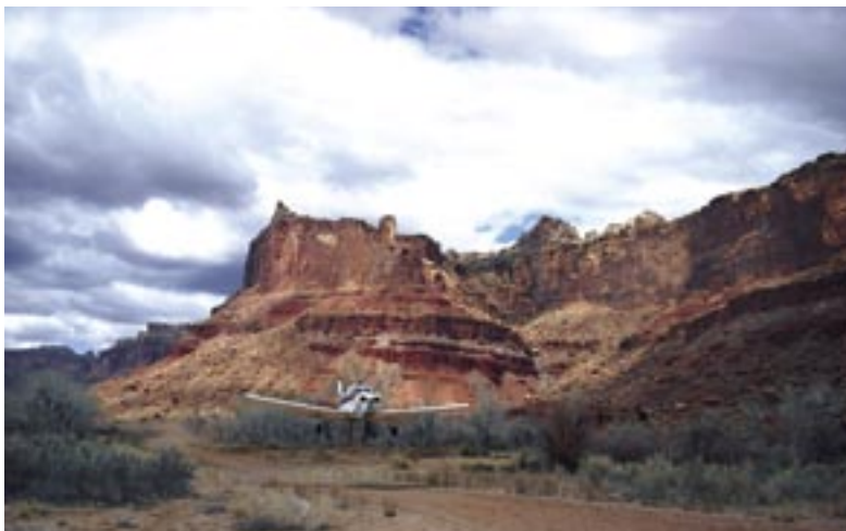
A view of the takeoff at Mexican Mountain.

692 in "Fly Utah!".) Go around Mexican Mountain making left turns over slot canyons, fly north past the trees, turn sharply left, and you'll see the 1,900-foot airstrip on short final. The first 500 feet is overgrown and not suitable for airplanes.