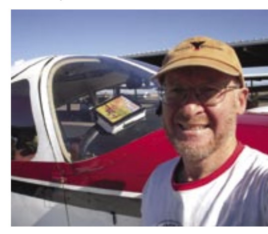
The author preparing for Moab, Utah.

tant. I pack three two-liter plastic bottles filled with water (not the thin-walled gallon jugs from the supermarket; they won't survive a crash or a freeze).